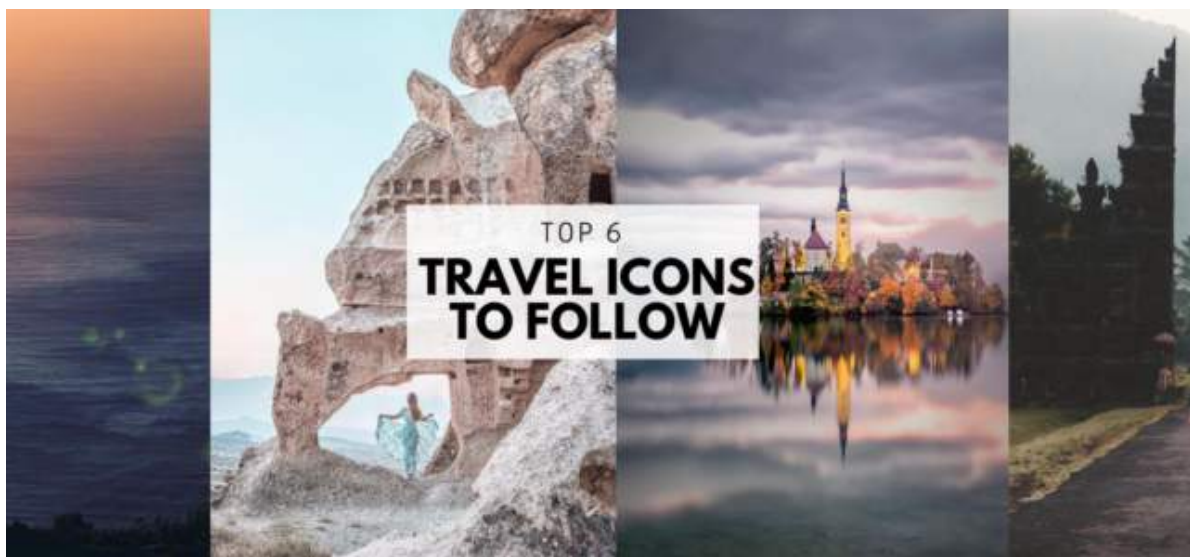
Top 6 Travel Icons to Follow