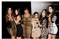
10 Ways to Travel Like a Kardashian Parachute ( http://parachute.mapquest.com/2015/01/23/10-ways-to-travel-like-a-kardashian/ )