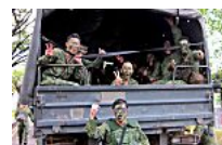
Commander didn't expect his letter to go viral ( http://news.asiaone.com/news/singapore/commander-didnt-expect-his-letter-go-viral )