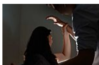
Menstruating teen raped by 2 men in KL ( http://news.asiaone.com/news/crime/menstruating-teen-raped-2-men-kl )