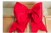
How to Make Giant Holiday Bows Momtastic ( http://www.momtastic.com/diy/581587-decorate-your-home-for-the-holidays/ )