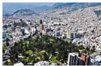
Ecuador from Sea Level to Sky High AFAR ( http://2015/01/23/10-tips/ecuador-from-sea-level-to-sky-high?utm_source=outbrain&utm_medium=sidebar&utm_campaign=ecuador )