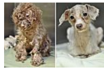
26 Tearful Before and After Photos Of Rescued Animals