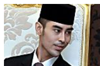
Johor prince laid to rest ( http://news.asiaone.com/news/crime/johor-prince-laid-rest )